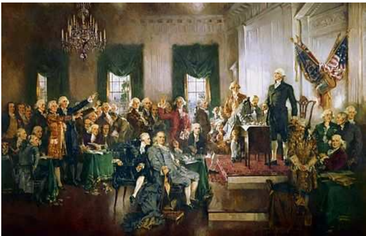
Scene at The Signing of the Constitution , by Howard Chandler Christy, 1940. Displayed along the east stairway in the House of Representatives wing in the Capitol building.